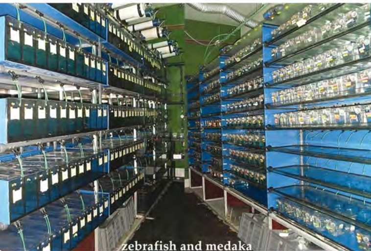
zebrafish and medaka

Aquatic Vertebrates Platform CABD, Sevilla