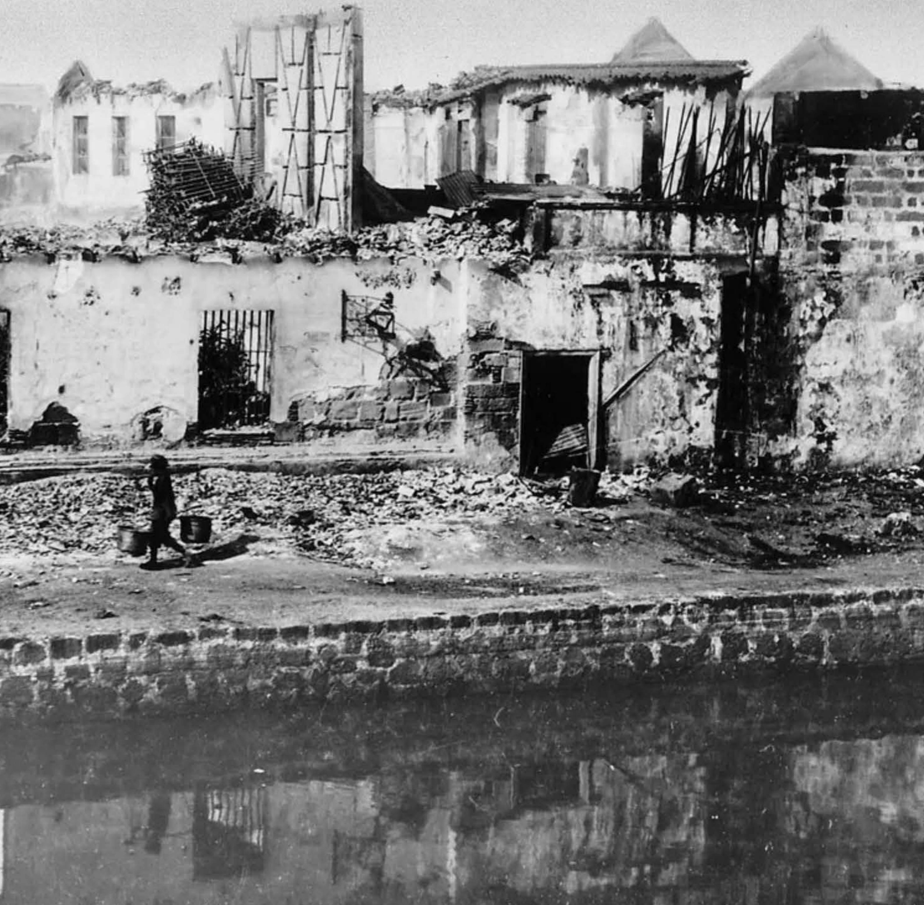
Image : Portion Ruin Forces Philippines Manila 1899