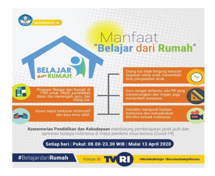
Figure 1. Online Learning Platform by the Ministry of Education and Culture, Indonesia through TVRI.

The continuity of the learning process has been pursued all over the world. In Indonesia, through Circular Publication Number 4 of 2020 concerning the Implementation of Education Policies in an Emergency Situation as the cause of Covid-19 Spread, learning at home is adjusted to the talents and interests of children. The CNN Indonesia (2020) has reported that the Ministry of Education and Culture of the Republic of Indonesia (KEMENDIKBUD) has provided several programs such as Home Learning to Learning from Home on TVRI and RRI to support students' learning process in every level of education.